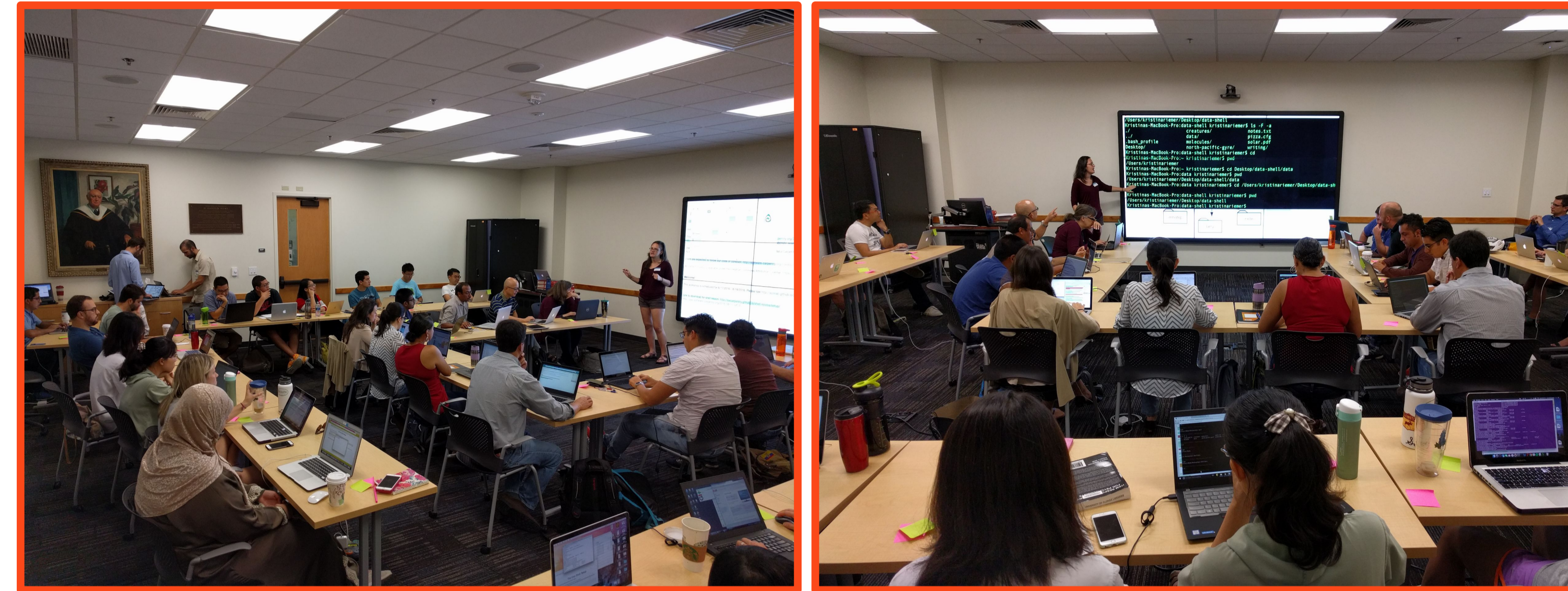
Fig 1. Pictures from a recent Software Carpentry workshop at the University of Florida.